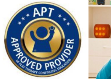
APT Approved Provider# 19-582